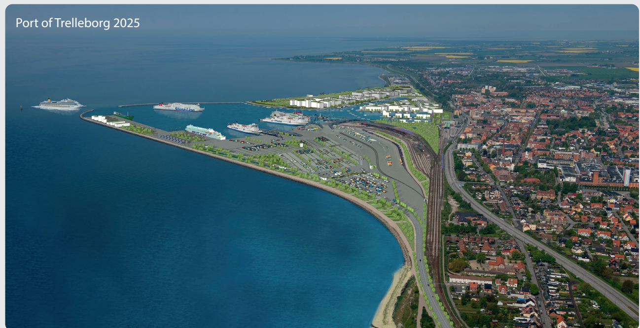
Image over future vision of an expanded port and a sea residential area.